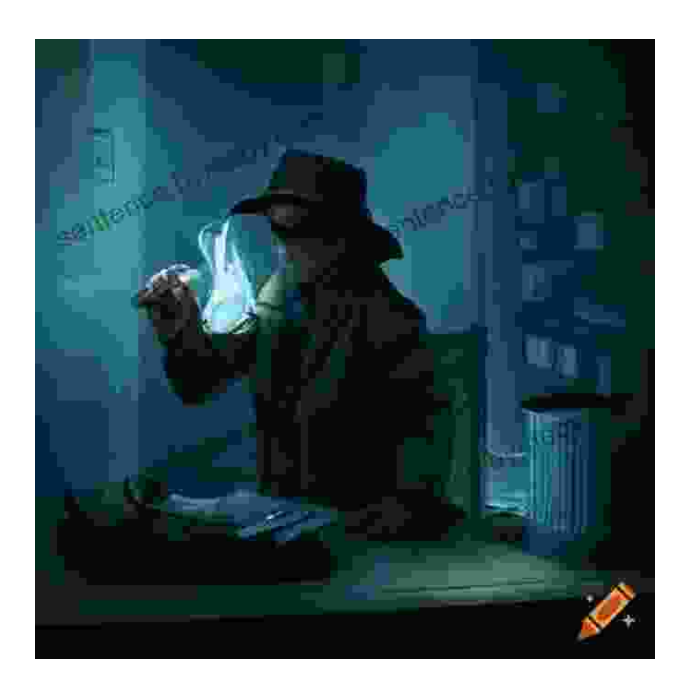
A World of Suspense and Thrills

relentless pursuit of justice uncovers secrets that threaten to shake the very foundations of society. With each investigation, he uncovers a web of corruption, deceit, and danger that tests his limits and challenges his beliefs.