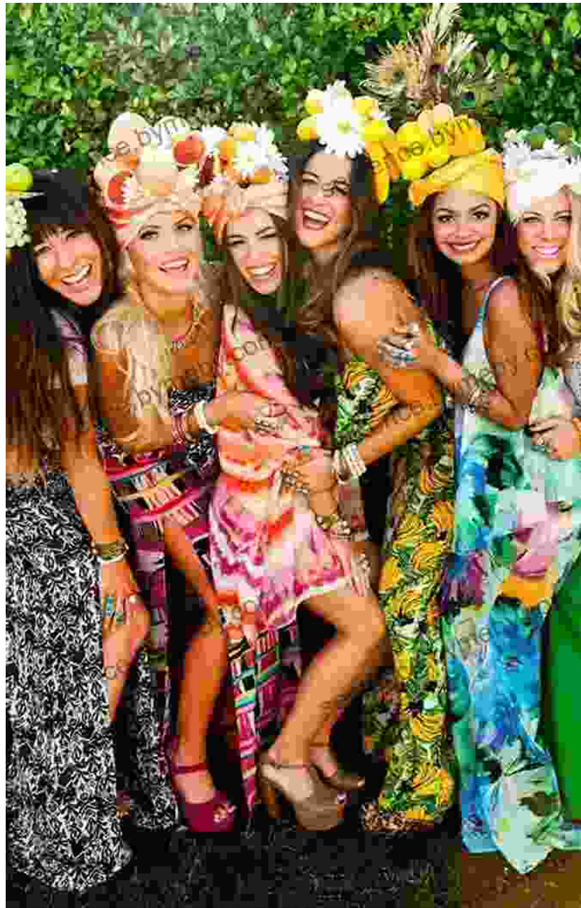
Immersive Experiences and Tropical Delights

Tiki enthusiasts come from all walks of life, united by their shared love for this unique and vibrant subculture. They gather at Tiki bars, attend festivals, and engage in lively online communities, sharing their knowledge and experiences with fellow aficionados.