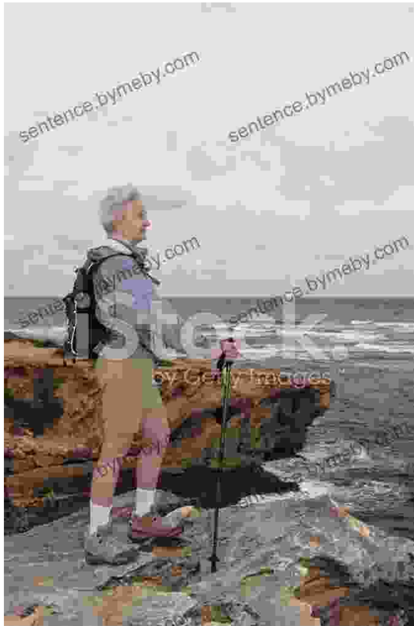
A hiker walks along a rocky shoreline with towering mountains in the background.