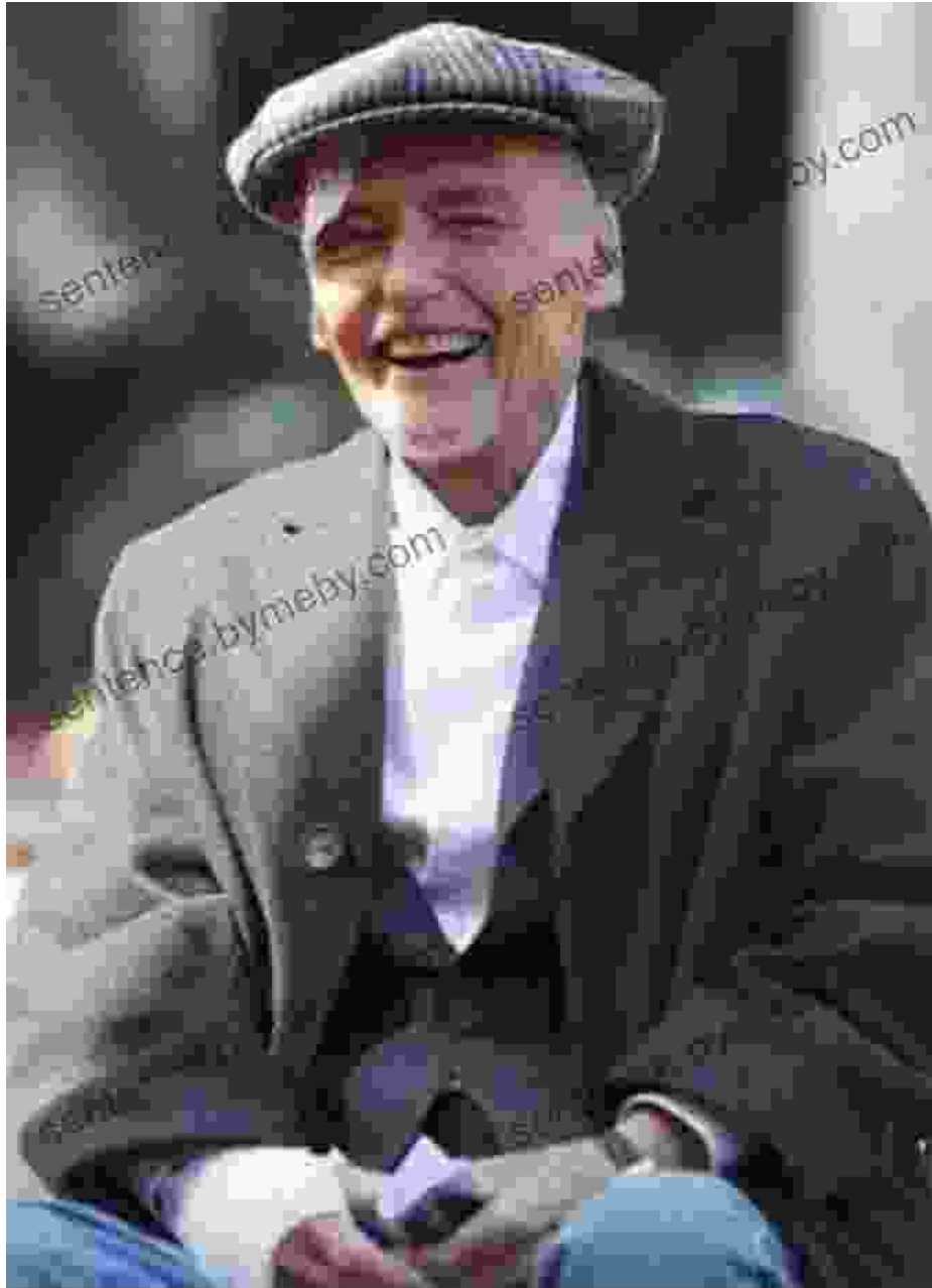
Dennis Hopper in Easy Rider (1969)

Hopper's most famous roles include Billy in Easy Rider (1969), Frank Booth in Blue Velvet (1986), and Howard Hughes in The Aviator (2004). He was nominated for an Academy Award for Best Actor for his performance in Easy Rider .