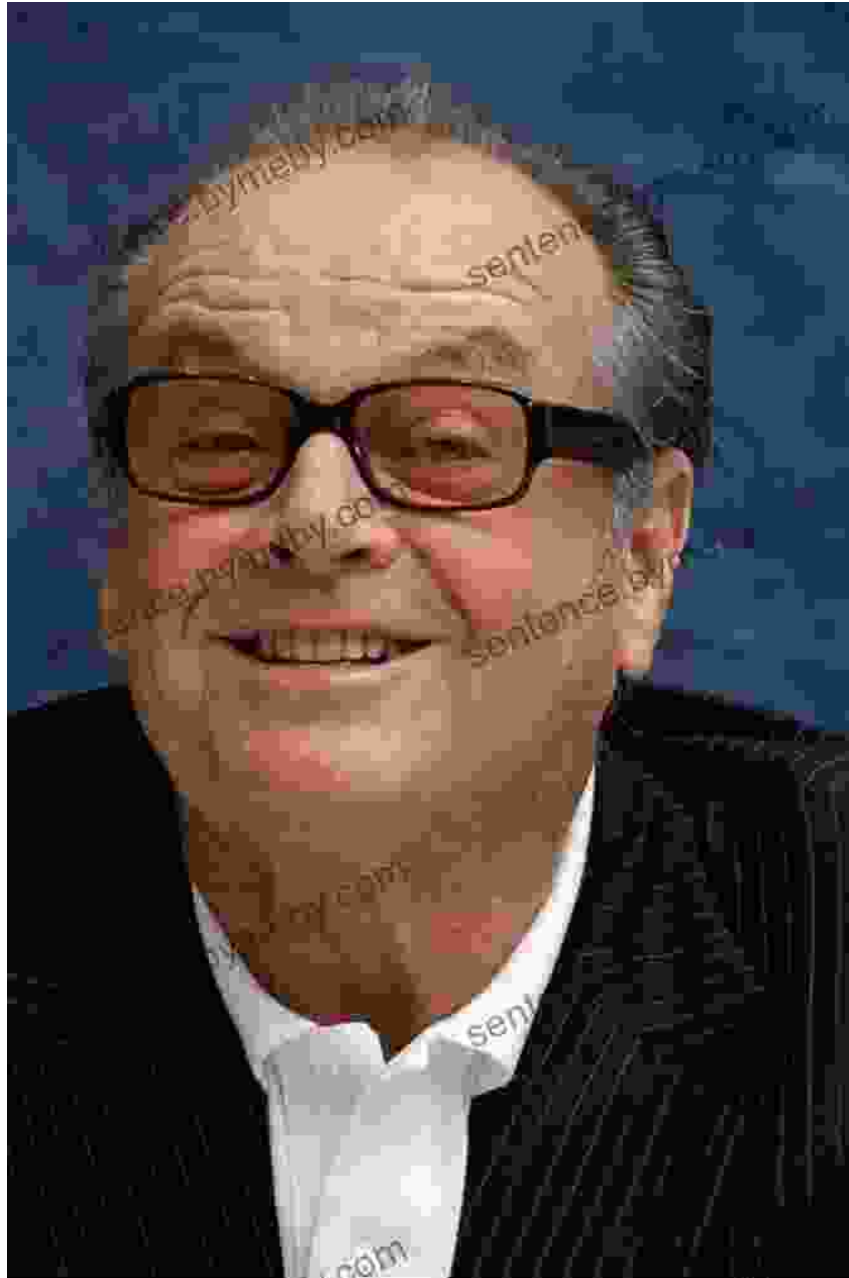
Jack Nicholson in One Flew Over the Cuckoo's Nest (1975)

Nicholson's most famous roles include Randle McMurphy in One Flew Over the Cuckoo's Nest (1975), Jack Torrance in The Shining (1980), and the Joker in Batman (1989). He has won three Academy Awards for Best Actor, for his performances in One Flew Over the Cuckoo's Nest , Terms of Endearment (1983), and As Good as It Gets (1997).