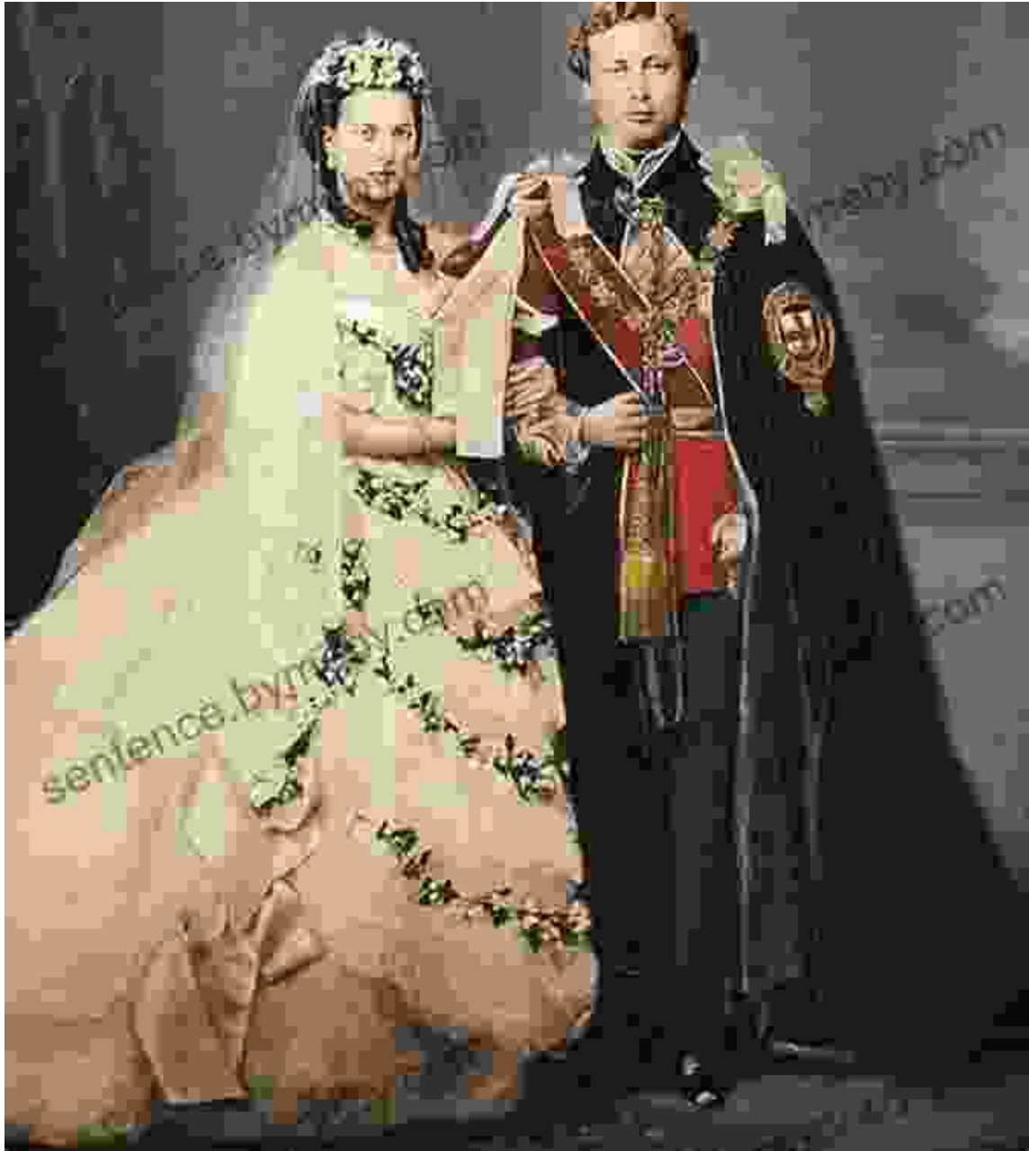
The Royal Couple: Victoria and Albert