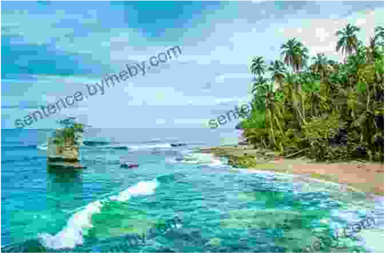
The pristine beaches of Southern Costa Rica are a sight to behold.