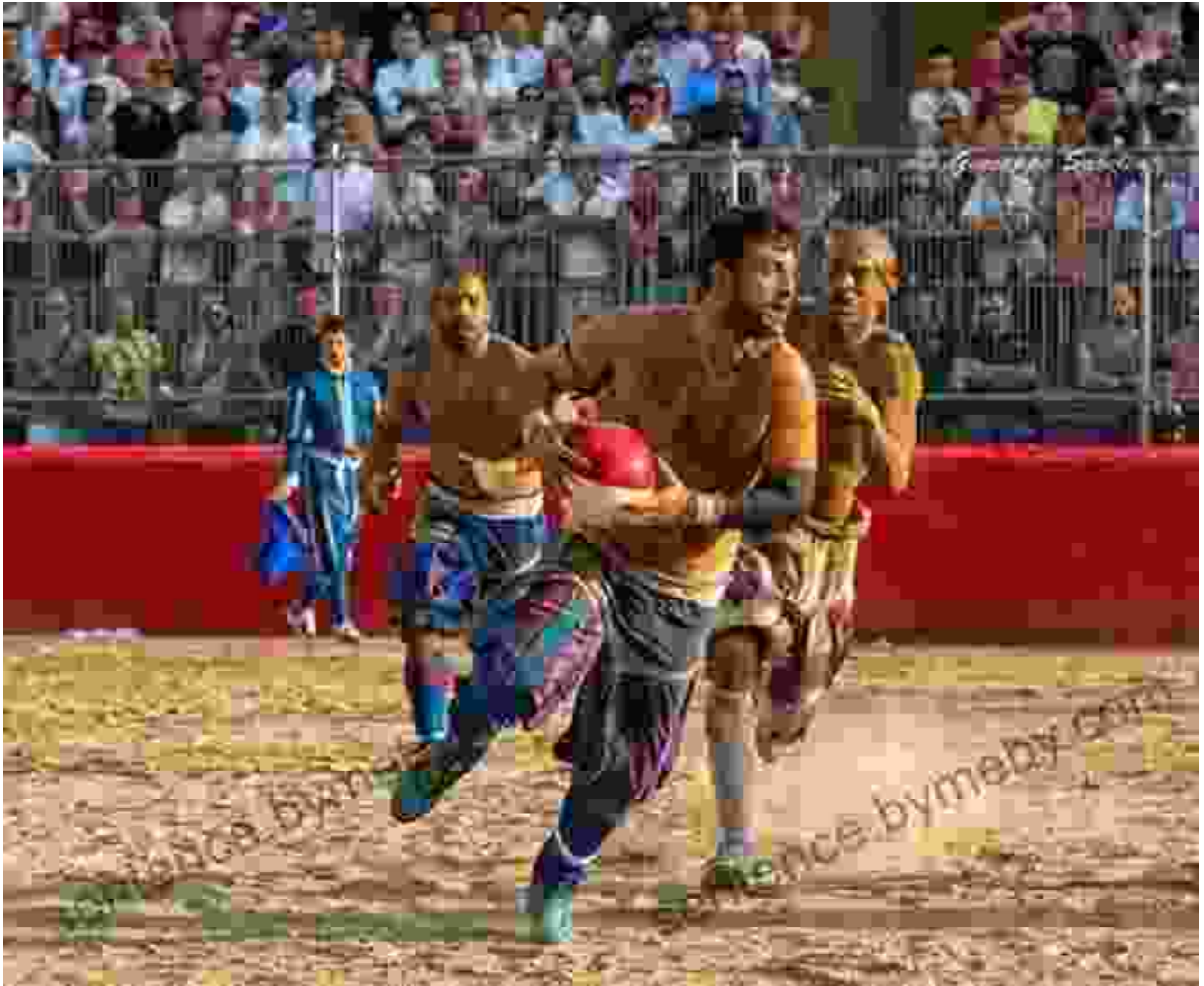
Calcio Storico, Florence