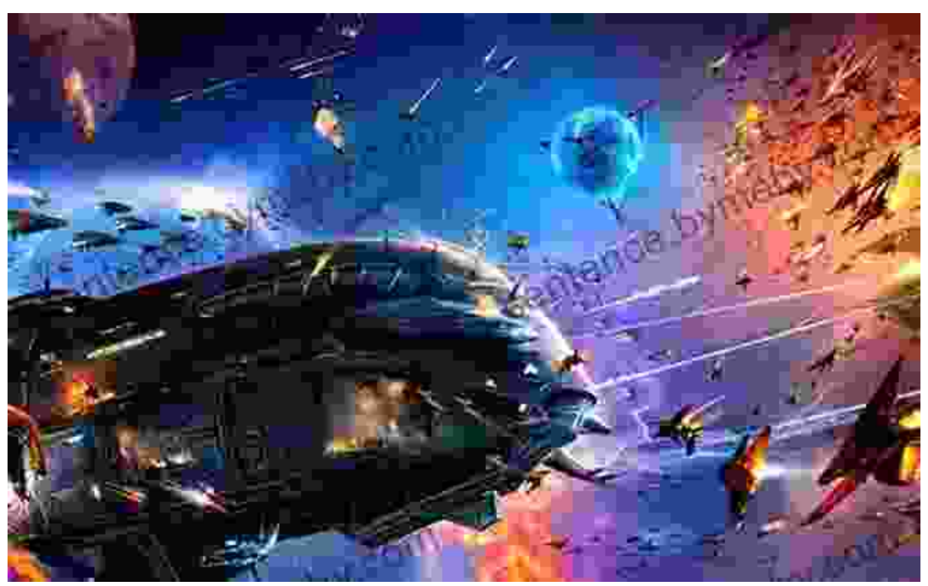
Unravel the Complex Web of Intergalactic Schemes

Experience firsthand the thrill of aerial dogfights and witness the devastation wrought upon extraordinary alien worlds. The pages of this book hold the key to unlocking an unforgettable tapestry of combat and chaos.