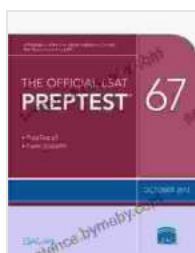
Image Description: The cover of The Official LSAT Preptest 67 features a bold blue and white design with the LSAT logo prominently displayed. The book title is written in a modern and eye-catching font, conveying the importance and relevance of this essential study guide.

The Official LSAT Preptest 67 is more than just a study guide; it's an investment in your future as a legal professional. Empower yourself with the knowledge, strategies, and practice you need to conquer the LSAT and achieve your law school dreams. Free Download your copy today and embark on the path to success!